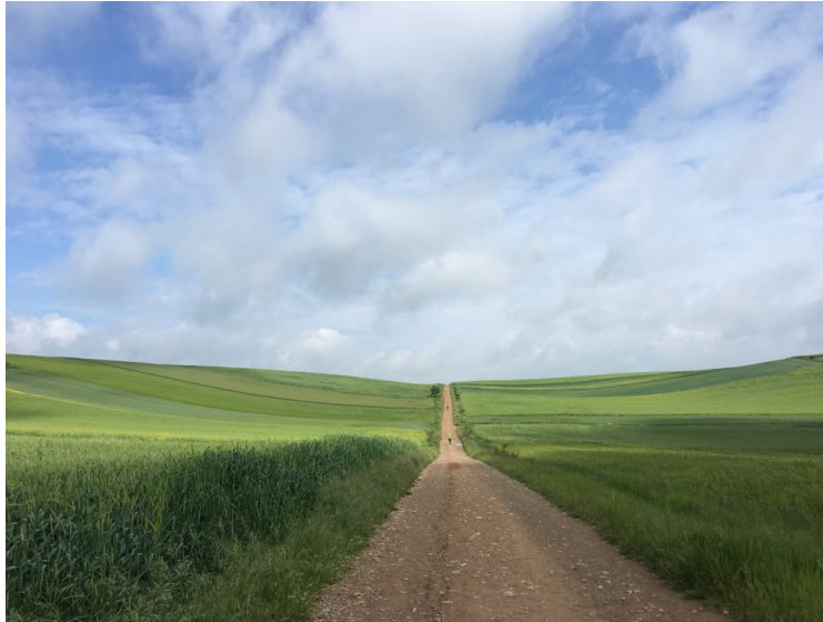
The Camino de Santiago in Northern Spain.

When Inge sets out on her journey from Norway to rural Minnesota to marry a man she's never met, she's traveling to a world she doesn't know. When she arrives, the heroine of Sweet Land, the Musical encounters surprising customs and traditions, and people with whom she can't easily communicate. It's a harrowing journey she must take alone. She is sustained by little more than faith and hope.